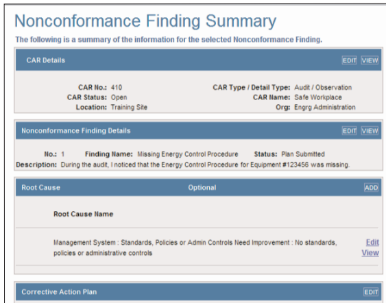
Finding Summary Page