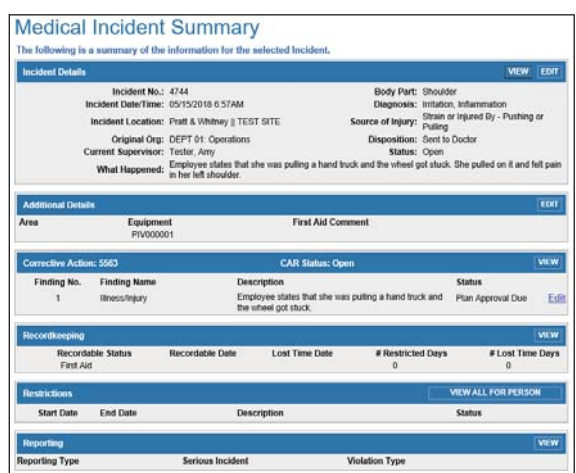
Medical Incident Summary