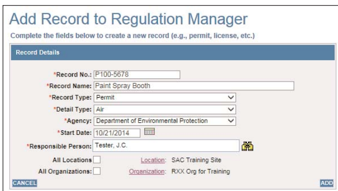
Add Record to Regulation Manager Page